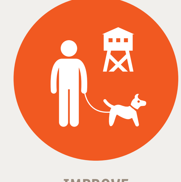
IMPROVE ADAPTATION TO SURROUNDINGS