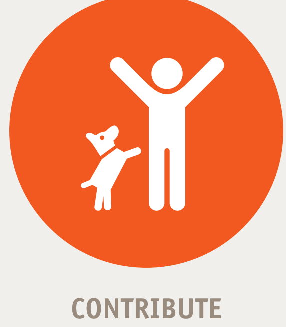
TO EMOTIONAL STABILITY